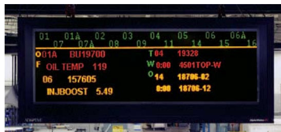
AlphaVision PC display

Many companies are aggressively pursuing productivity programs; 5s, Six Sigma, Lean...to meet these requirements and are finding success in their ability to both satisfy the customer and profitably grow their businesses.