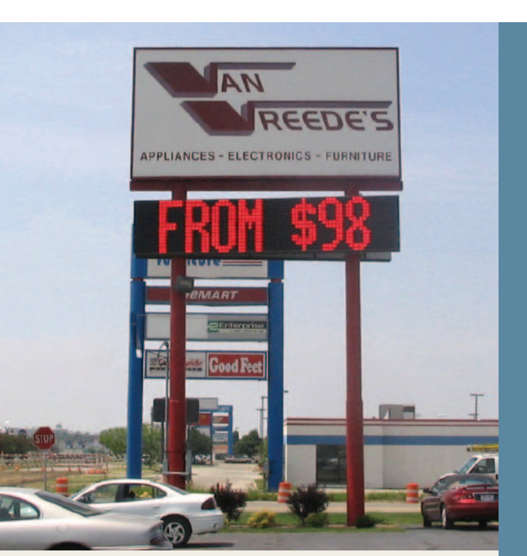
AlphaEclipse Roadstar 16 x 80 89mm Red