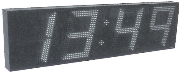
AE126-354 System Clock