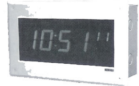
AE2412 Flush Mount Digital Clock