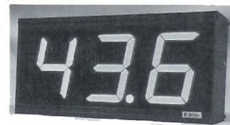
AE43D Process Indicator