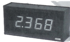
AE24 Process Indicator