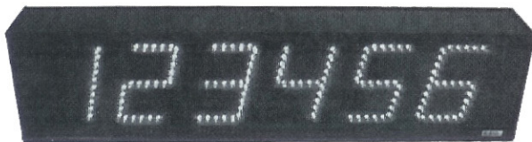
AE46S Process Indicator