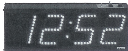
AE44S Digital Clock